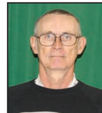
Bill Cotner Grounds