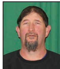
BJ Jackson Grounds